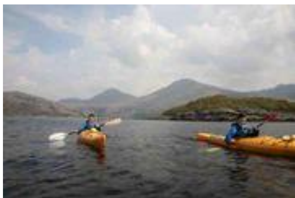
44 th Glasgow Scouts – Sea kayaking

The next formal meeting of the Trustees is scheduled for 23 rd September and we look forward to having another batch of grant applications for consideration. After the event please also remember to send us a brief report. Quite a few reports remain outstanding in respect of some of the above and also previous grant supported activities. With the increasing demand for grants failure to submit a report could prejudice your next grant application.