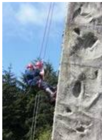
Milngavie Guides – Auchengillan