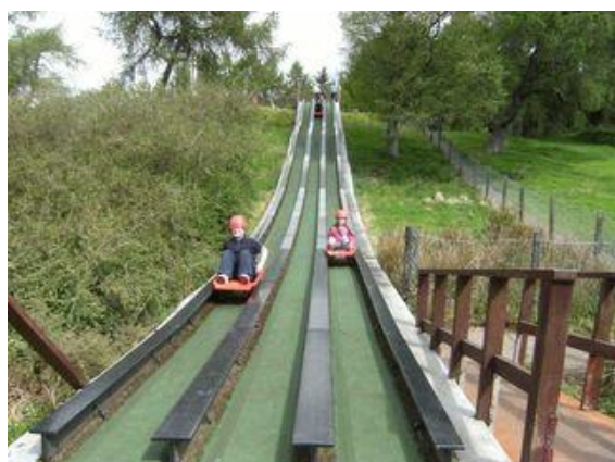
Milngavie Guides – Auchengillan