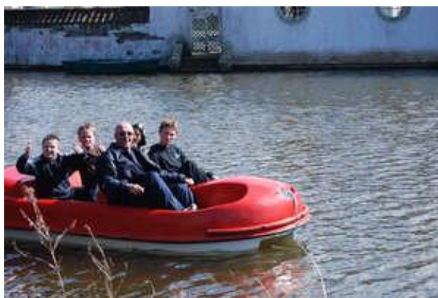
277 th Glasgow Boy's Brigade – Junior Section – St Andrews