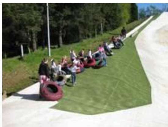
Westerton Rainbows – Bearsden Ski Club