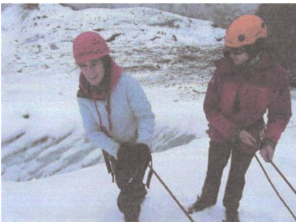
"Lowering Scouts into crevasses is always fun" 29 th Glasgow Explorer Scouts – Switzerland, July 2011