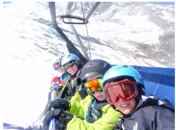
1 st Glen Lusset (Old Kilpatrick) Scout Group – Saas-Fee, Switzerland, April 2011