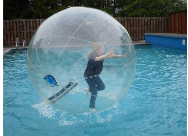
9 th Miingavie Guides, Auchengillan, May 2011