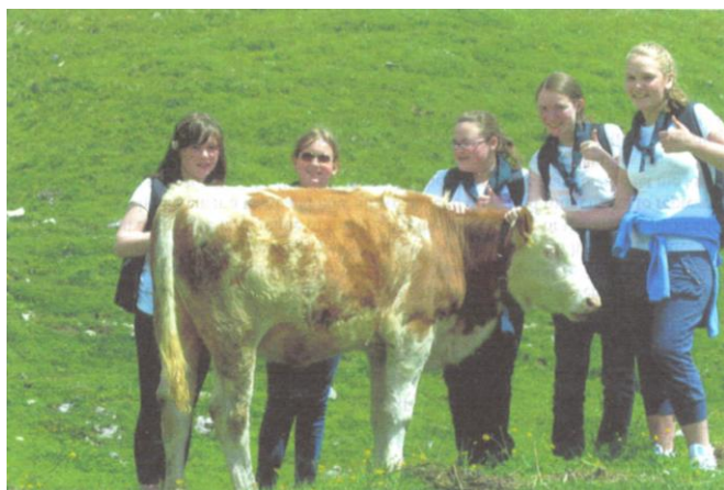
"Making friends with the locals" 12th Clydebank Guides - Switzerland, July 2011