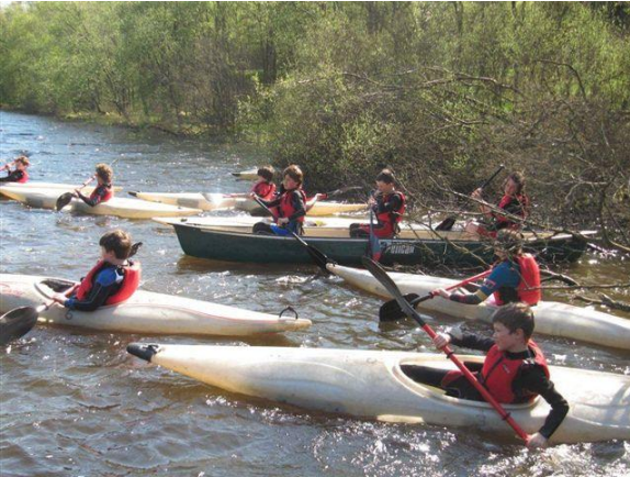
24 th Glasgow Scouts - Aberfoyle, April 2011