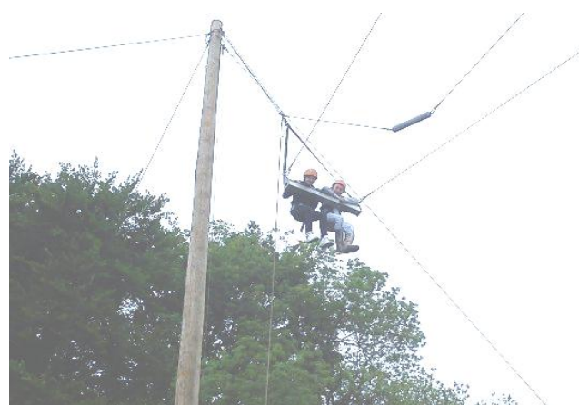
6th Clydebank Guides – Kingswood Outdoor Centre, Hexham, June 2011