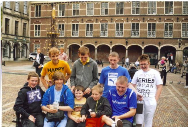
277 th Glasgow Boys' Brigade – Holland, July 2011