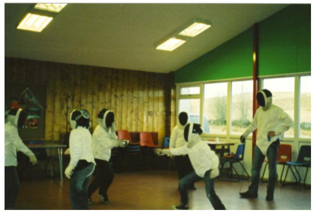
80 th Glasgow Cub Scouts – Auchengillan, March 2011