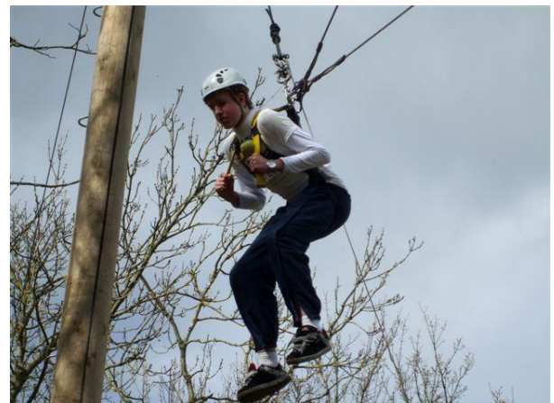
183 d Glasgow Scouts – Fordell Firs, April 2011