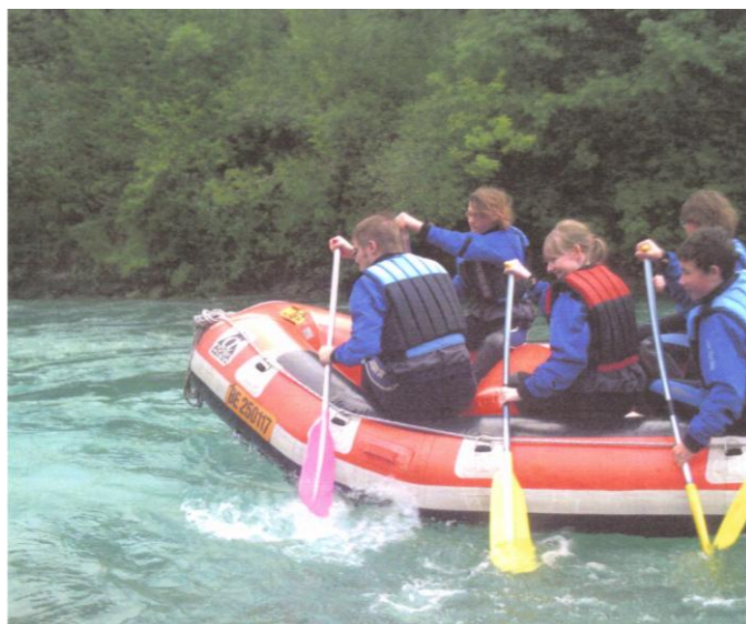
"We hit some rapids and the team got stuck in" 29th Glasgow Scouts – River Aare, Switzerland