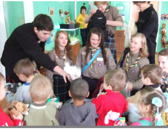
21 st Aberdeen (Cults) Scout Group - Gomel City Social Educational Centre, Belarus, October 2010