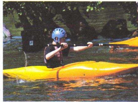
1 st Bearsden Boys' Brigade Water Activities, Carlton Lodge Outdoor Centre, June 2010