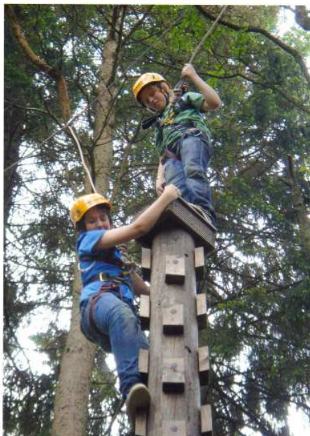
86 th /191 st Glasgow Cubs and Scouts Auchengillan, June 2010