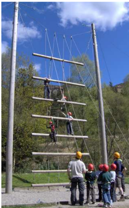
24 th Glasgow Cub Scouts Lochgoilhead, May 2010