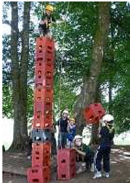
4 th Glasgow Cub Scouts Auchengillan, June 2010