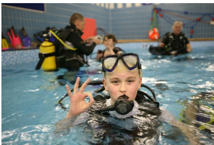
44 th Glasgow Scouts Scuba Diving training, February 2010