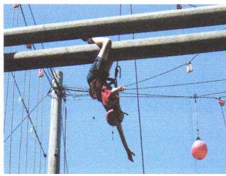
1 st Bearsden Boys' Brigade High Ropes Course, Carlton Lodge Outdoor Centre, June 2010