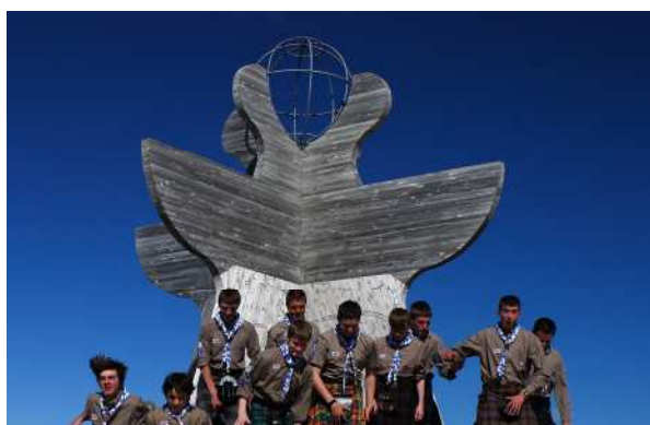
24 th Glasgow Explorer Scouts Arctic Circle, Norway, July 2010