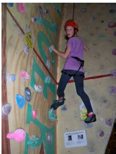
8 th Bearsden Guides Glasgow Climbing Centre, June 2010