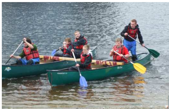
183 d Glasgow Scouts Loch Lomond, June 2010